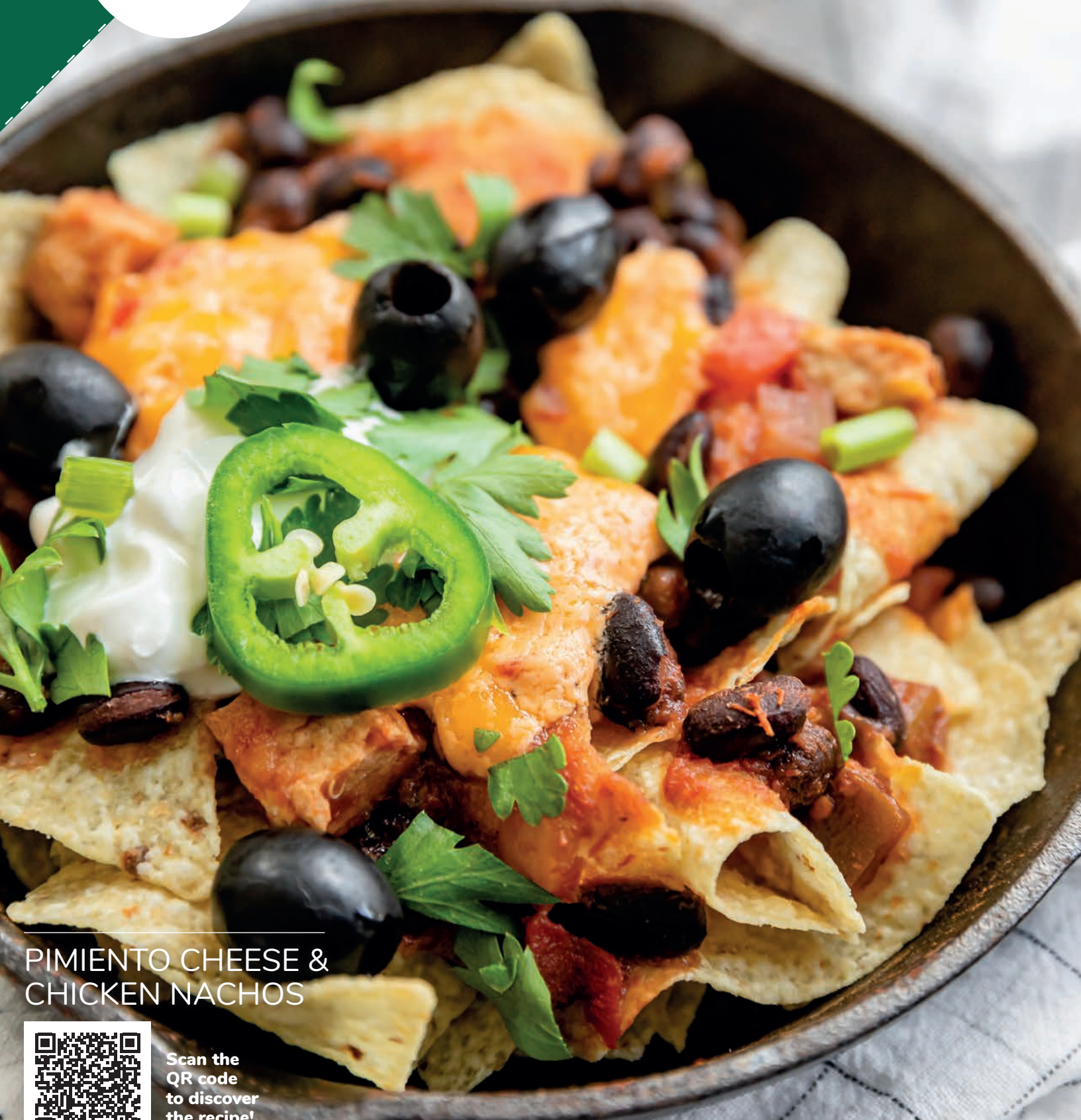
PIMIENTO CHEESE & CHICKEN NACHOS